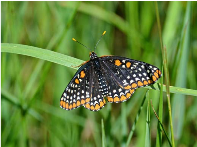
Baltimore butterfly at the Preston Nature Preserve.