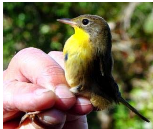
Common Yellow-throat, a Warbler.

Banding will start at the preserve, located on Wilcox Road (off Route 1 in Stonington) at Sunday, October 25 at 8am . Rain cancels.