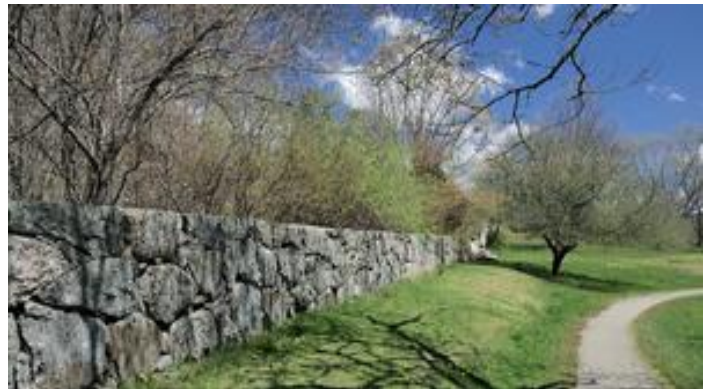
Haley Farm

Hike Stonington. This self-guided program is offered by the Town of Stonington recreation department and features a number of Avalonia preserves and trails. More details at our website: http://avalonialandconservancy.org