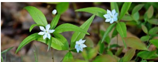
Starflowers

Hike Stonington. This self-guided program is offered by the Town of Stonington recreation department and features a number of Avalonia preserves and trails. More details at our website: http://avalonialandconservancy.org